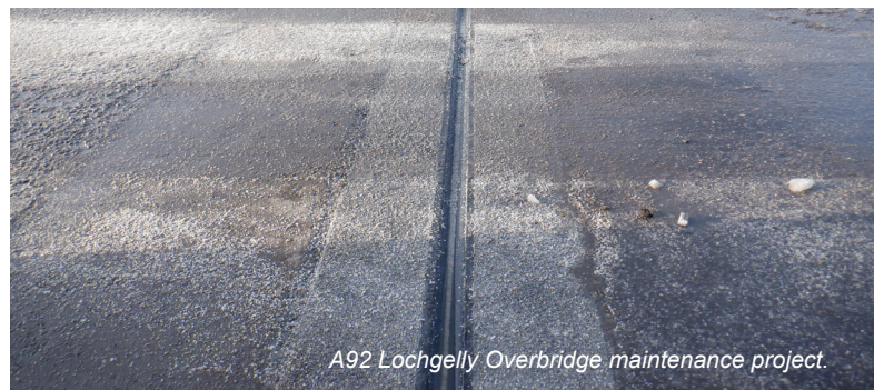
A92 Lochgelly Overbridge maintenance project.