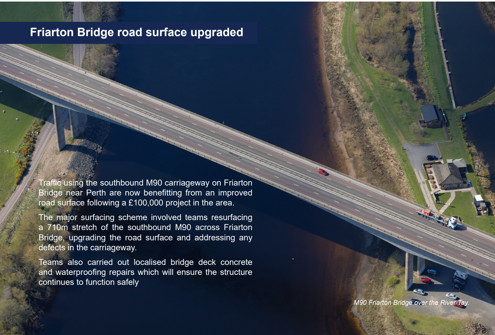
M90 Friarton Bridge over the River Tay.

Teams also carried out localised bridge deck concrete and waterproofing repairs which will ensure the structure continues to function safely