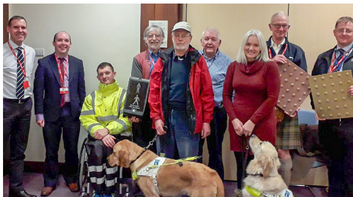
BEAR Scotland and Transport Scotland met with the Inverness A82 Visually Impaired Working Group to discuss the future crossings project.

The meeting was useful to gain a first-hand understanding of how visually impaired users travel around the network and the challenges they face. The knowledge gained from the meeting will contribute to increasing accessibility for all road users on the trunk road network in future projects.